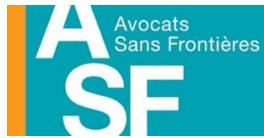
Avocats Sans Frontières / Lawyers Without Borders