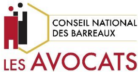
Conseil National des Barreaux les Avocats – National Bar Council of France / France